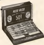
JEWELRY TYPE DISPLAY BOX

A clever ratchet in cap end of the mechanism permits cap to idle when clutch is backed up to the limit. Makes ticking noise like a watch. Eliminates danger of injury to mechanism through twisting of cap beyond normal limits.